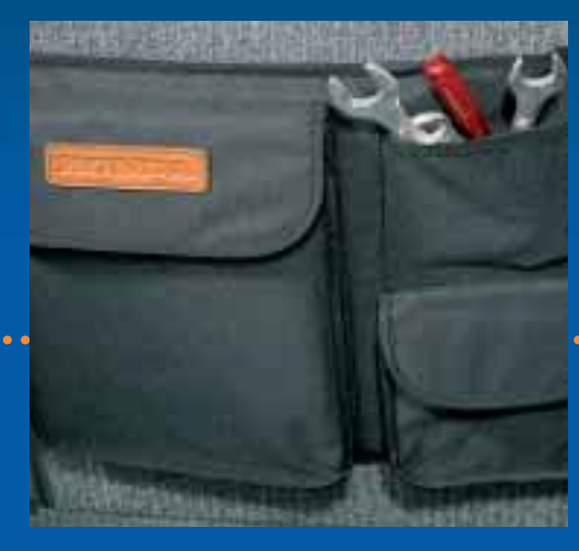
Rear Seat Back Boot Tidy